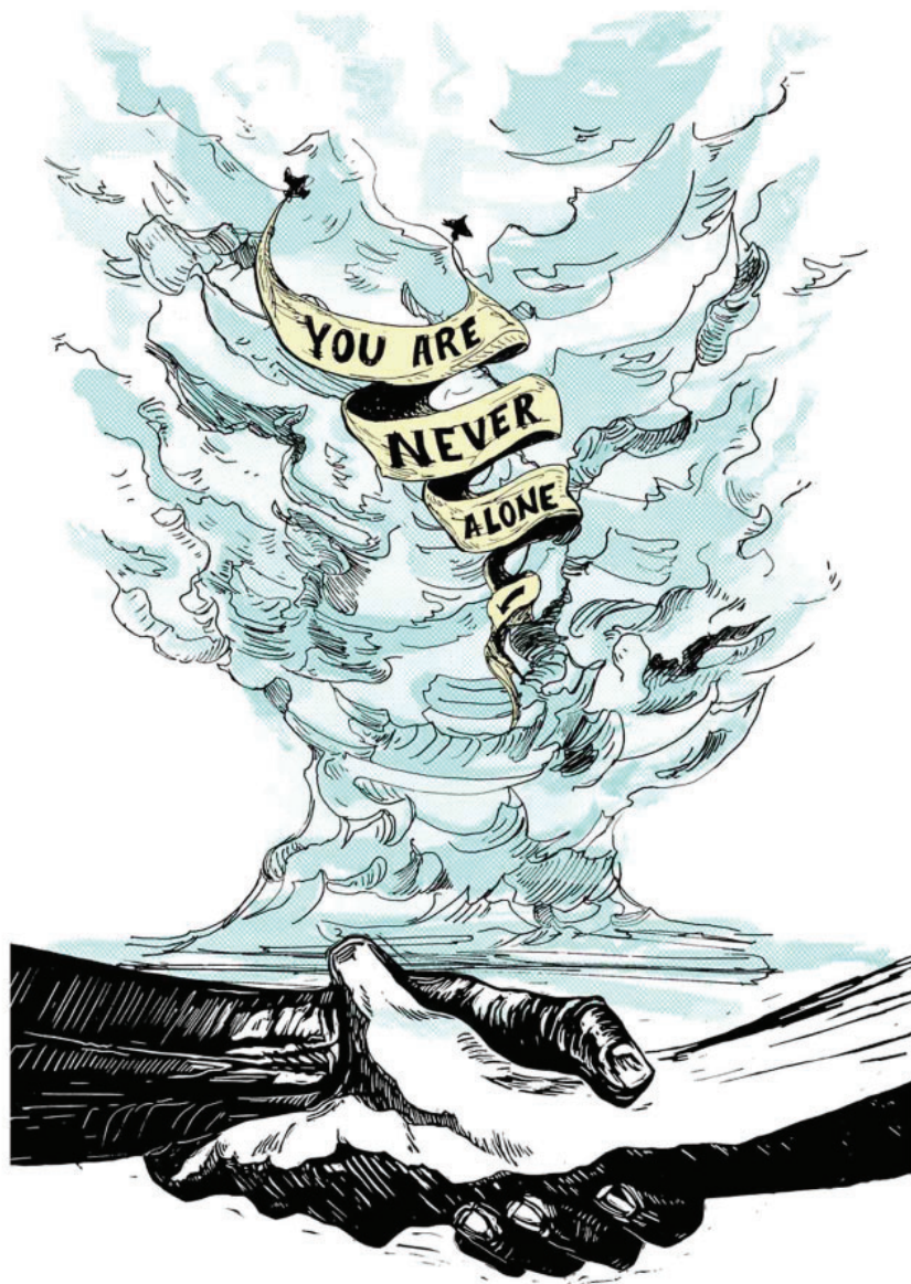
Pete Railand, 2015 justseeds.org